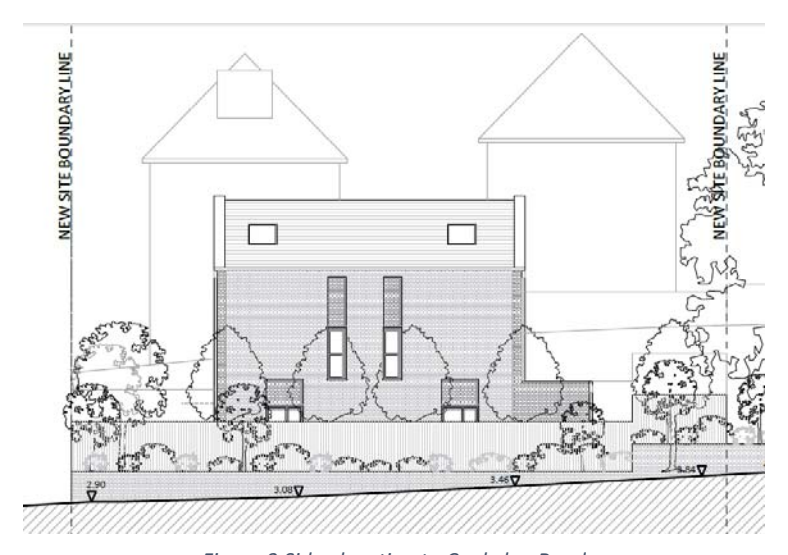
Figure 3 Side elevation to Coulsdon Road