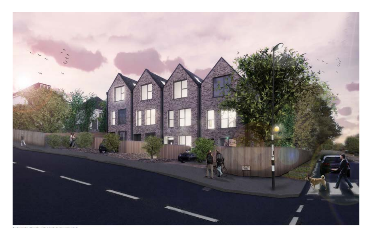
Figure 6 CGI of proposed scheme

terms of its height and breaking down the massing through high quality design and appearance. The appearance from Cearn Way and spacing to the front and host properties would be good, whilst it would appear tighter to Coulsdon Road and to the rear. The scheme is considered to be an appropriate design response.