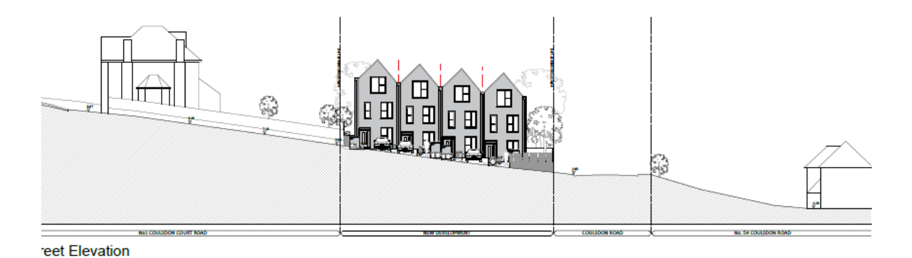
Figure 4 Streetscene showing relative building heights

8.15 The terrace would be wider than the detached / semi detached properties typically found in the area, although less wide than some of the other terraced buildings in the wider area. With the stepping down the hill; roof form with each property having a gable and detailed design to differentiate the four houses through shadow gaps, rainwater goods and front boundary treatments, the mass and scale of the building