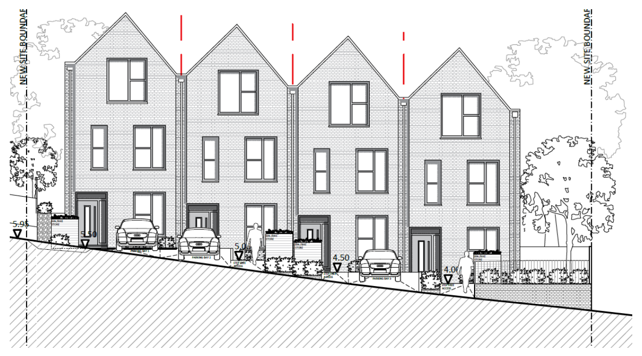
Figure 5 Front elevation facing Cearn Way

8.16 The dwellings are contemporary and take a townhouse style approach, featuring pitched gabled roofs which step down towards Coulsdon Road and finished with parapet coping, and a single storey flat roofed rear extension. The dwellings would be finished in red tonal brickwork and feature recessed darker brick work detail to the elevations, and dark grey aluminium windows and doors. The proposed design would provide an element of articulation to the property and visual interest and it is considered that the design and appearance would achieve a balance of an irregular frontage of visual interest whilst maintaining design continuity with the neighbouring properties, given the proposed materiality.